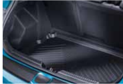
TRUNK LINER Part Number: A6122ADE00