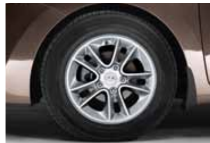
ALLOY WHEEL KIT 15" Part Number: A5F40AC100 (without TPMS)