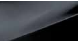
Phantom Black (PAE)