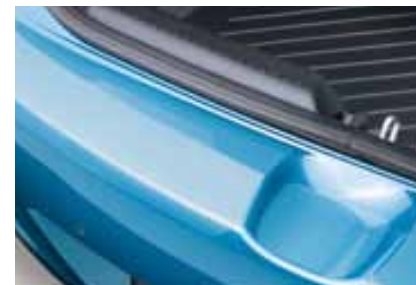
REAR BUMPER LOADING PROTECTION, TRANSPARENT Part number: A6272ADE00TR