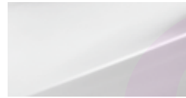
Creamy White (TCW)