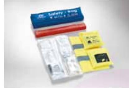
SAFETY KIT Part Number: 99940ADE00