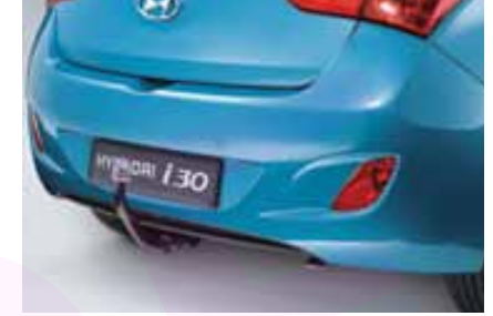
DETACHABLE TOWBAR Part Number: A6281ADE01