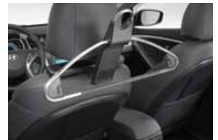
DETACHABLE COAT HANGER Part Number: 99770ADE00