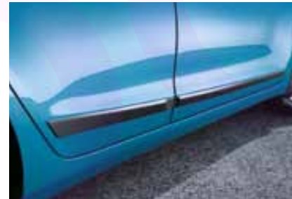
SIDE DOOR MOULDING Part Number: A6271ADE00