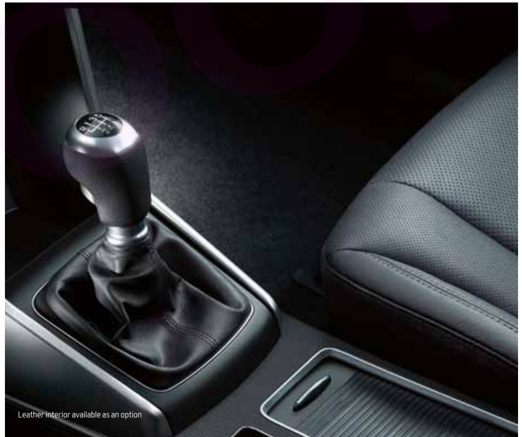
Leather interior available as an option