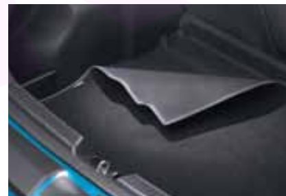
TRUNK MAT, REVERSIBLE ANTI-SLIP WITH LUGGAGE UNDER TRAY Part Number: A6120ADE10