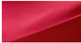
Cool Red (TWR) Available in the Deluxe model only