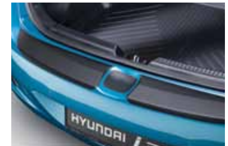
REAR BUMPER LOADING PROTECTION, BLACK Part number: A6272ADE00BL