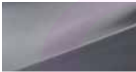
Steel Grey (ZAR)