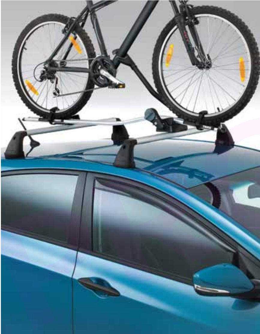
*ROOF CROSS BAR (A) Aluminium Part Number: A6210ADE00AL

*Only available for vehicles with fixing points