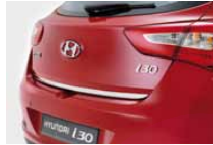
TAILGATE TRIM LINE Part Number: A6491ADE00ST