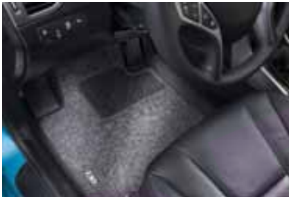
TEXTILE FLOOR MAT, VELOUR Part Number: A6143ADE10