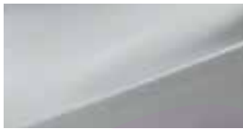
Sleek Silver (RAH)