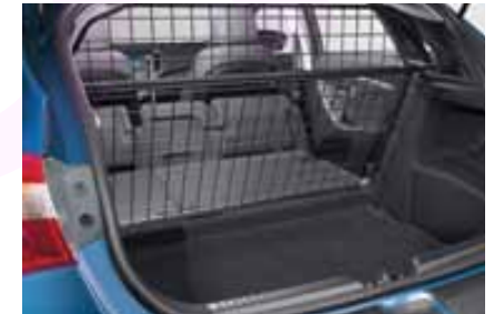
CARGO SEPARATOR MAIN-FRAME Part number: A6150ADE00 (Lower) Part number: A6151ADE00 (Upper)