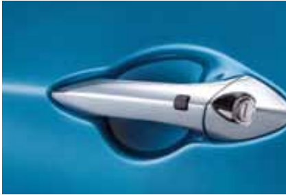
PROTECTION FOIL FOR DOORHANDLE RECESS, TRANSPARENT (SET OF 4) Part Number: 99272ADE00