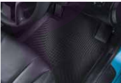
RUBBER FLOOR MAT Part Number: A6131ADE10