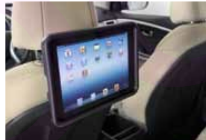
iPAD HOLDER Part Number: 99582ADE00