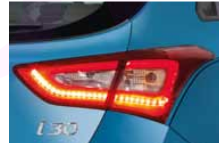
REAR LED LIGHT Part Number: A5F54AC000