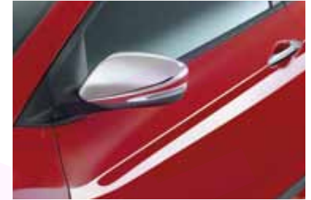
CHROME MIRROR COVERS Part Number: A6431ADE00ST