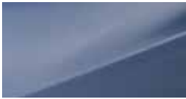
Blue Berry (WAE) Available in the Deluxe model only