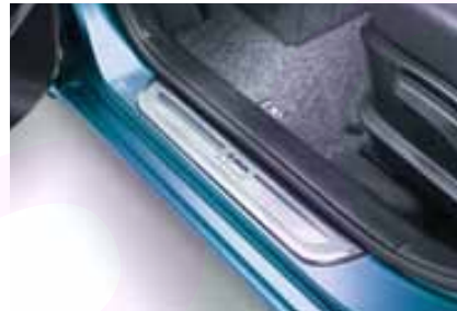
ENTRY GUARDS Part Number: A6450ADE00